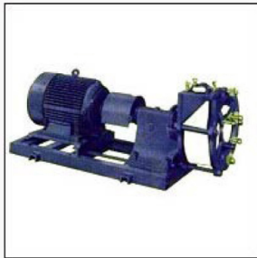
Horizontal Plastic Chemical Pumps