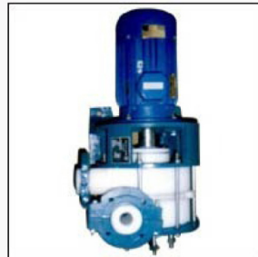
Vertical Sealless Glandless Pumps