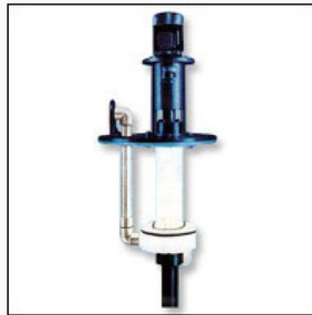
Vertical Sealless Sump Pumps