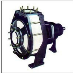
Horizontal Plastic Chemical Pumps