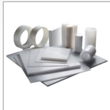
Nylon Plastic Sheets And Rods