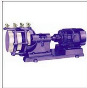
Horizontal Self Priming Pumps