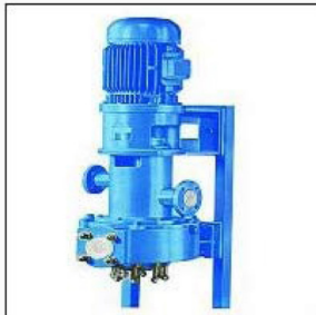
Vertical Sealless Glandless Pumps